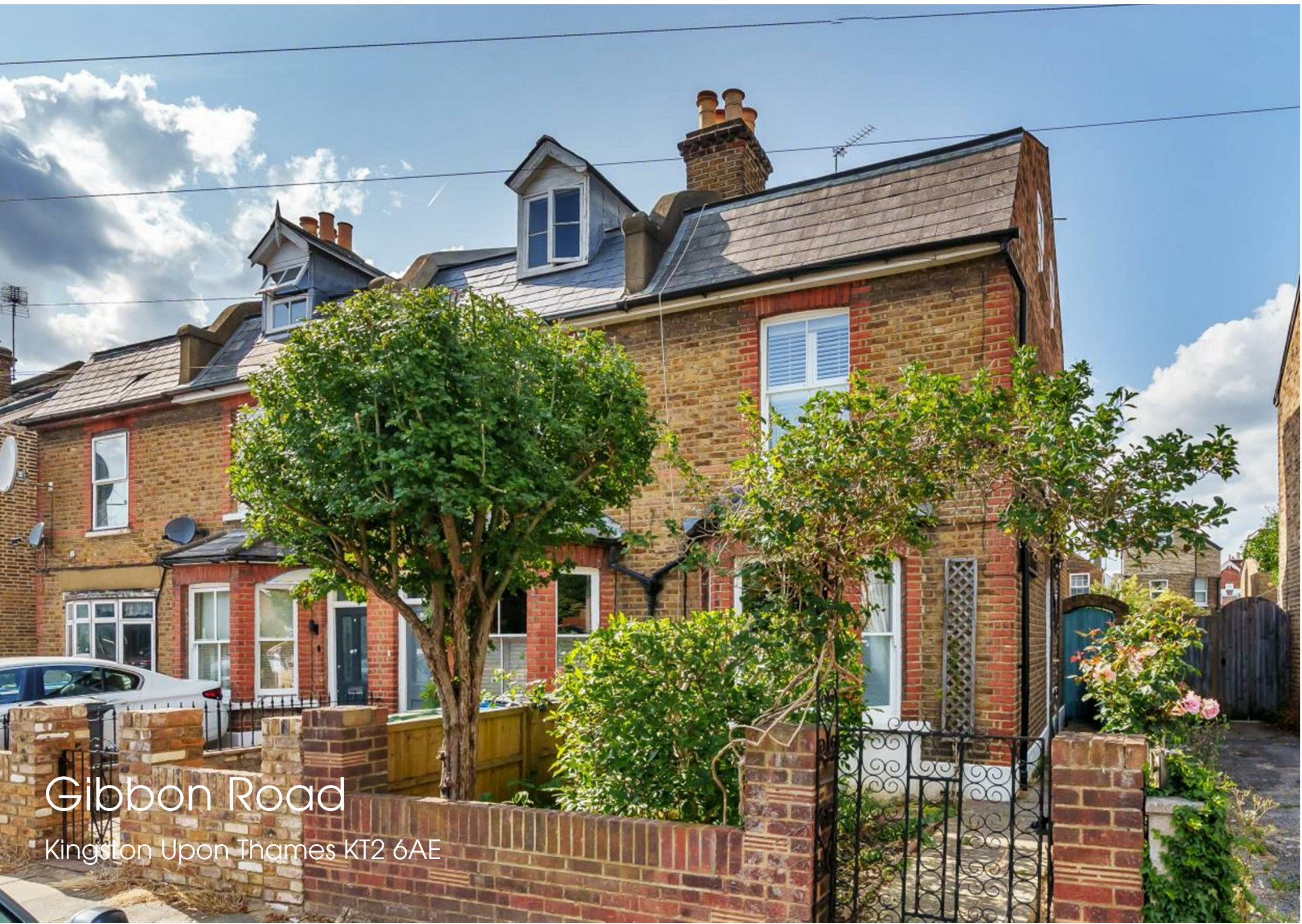
Gibbon Road Kingston Upon Thames KT2 6AE

34 Richmond Road Kingston upon Thames Surrey KT2 5ED www.gibsonlane.co.uk Tel: 020 8546 5444